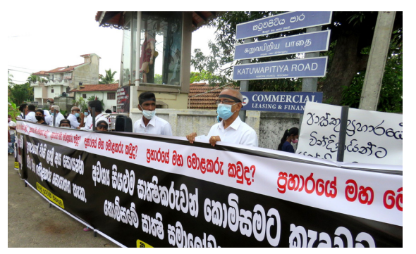
The banner: Who is the real mastermind of the attack?

Both the COI and PSC have concluded that former President Sirisena had been informed of the