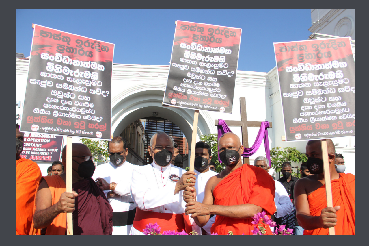
On 21 April 2021 clergy and people gathered to commemorate of the Easter Sunday attack and victims. Roughly translated placards say "Easter Sunday Attack is an organised murder. Will the law be applied to those who were directly involved and those who deliberately elude their responsibility in the murder? Implement the Justice Now!"