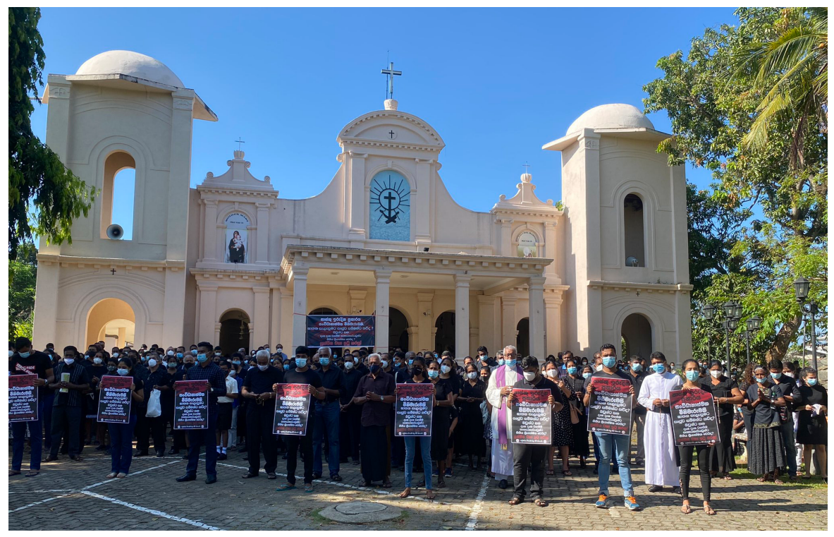
Campaigns for justice and accountability have been on going for almost 3 years.