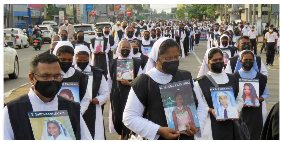
Commemoration on 21 April 2020

For nearly three years, the Catholic Church has been calling for justice for the Easter Sunday victims, through media briefings, demonstrations, and prayer vigils.